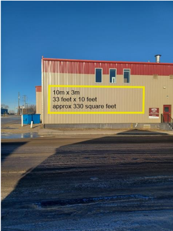
Approximate area for project

For that purpose, a modest budget has been allocated for a project that will allow something new to be installed on a southwest section of the building wall/ façade: