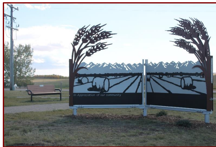
Pictured: Plaque dedication side of the installation

“People typically wish a donation plaque, often in memory of loved one, to be installed on a particular donated asset like a bench or tree in a favoured location. However, sometimes the trees don’t make it, an asset wears out or is damaged beyond repair. We are then left with a unique plaque - that is important to somebody - without a home or purpose. Going forward, many such donations will be recognized through a plaque on this installation instead. It is our hope that this piece of public art will also inspire more donations to our ‘Public Realm’ reserve, created in part to hold donated funds until we undertake a strategic annual workplan of park, trail and boulevard improvements in line with the wishes of donors.” Neil Smith, Chief Administrative Officer